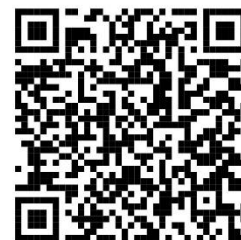
Zeffy Online Giving QR Code

Exodus 16: • "He who gathered much did not have too much, and he who gathered little had no lack"