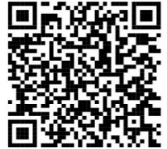
Zeffy Online Giving QR Code