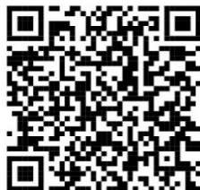
Zeffy Online Giving QR Code

Exodus 16: • "He who gathered much did not have too much, and he who gathered little had no lack"