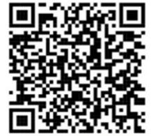
Zeffy Online Giving QR Code

Matthew 6: • Our hearts will be where our treasure is. 1 Corinthians 16: • If we're gonna do it, let's do it now. 2 Corinthians 8: • Not a command, but love must be sincere • Christ's own giving is our standard • If you're ready, give according to what you have, not what you don't • Not for the ease of others at your expense, but in the interest of equality. Exodus 16: • "He who gathered much did not have too much, and he who gathered little had no lack"